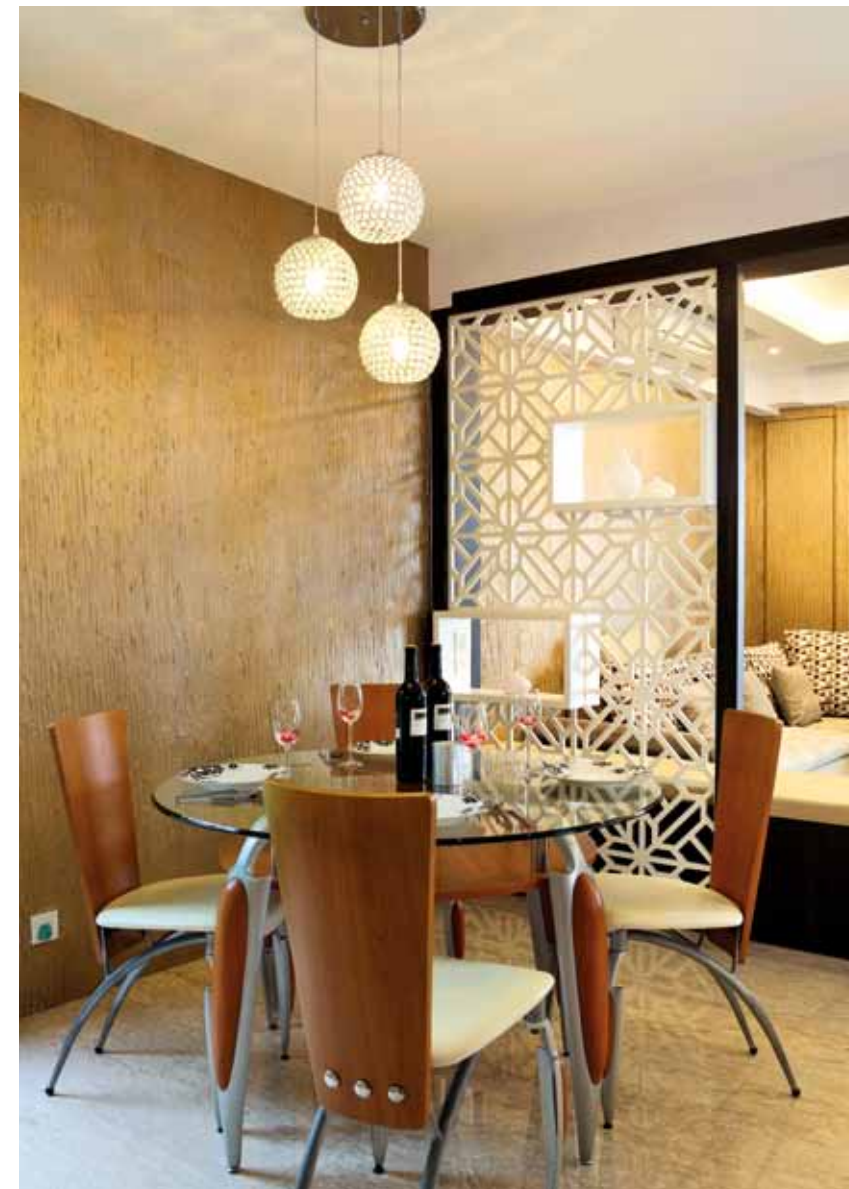
STYLE FILE 1

IN ORDER FOR A PROJECT TO BE DONE WELL, THE DESIGNERS NEED TO REALLY GET INVOLVED – VISITING THE SITE FREQUENTLY, MAKING SURE THAT THINGS ARE GOING EXACTLY AS PLANNED.